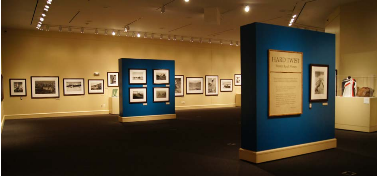
Exhibit Installation Views