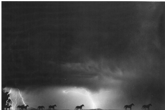
Hot Storm, 1993 41.5 x 51.5"