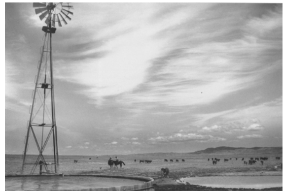
Farr Cattle Company, 1993 41.5 x 51.5"