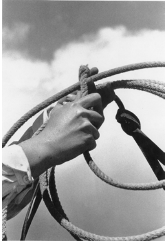
Hard Twist, 1986 31.5 x 25.5"