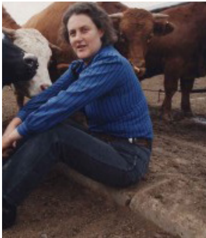
3. T E M P L E G R A N D I N P H . D