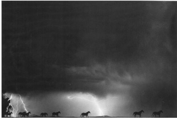
Hot Storm, 1993 41.5 x 51.5"