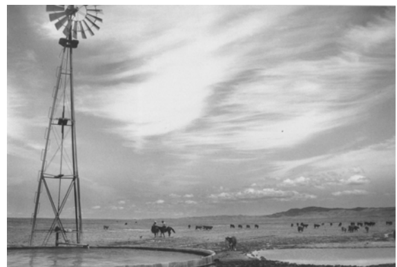
Farr Cattle Company, 1993 41.5 x 51.5"